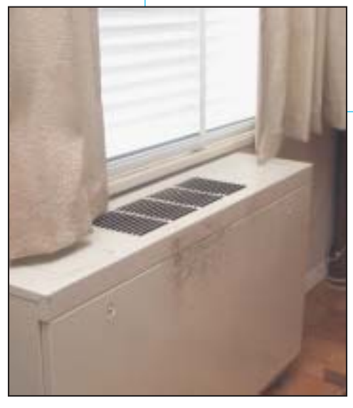
Mold growing on the surface of a unit ventilator.