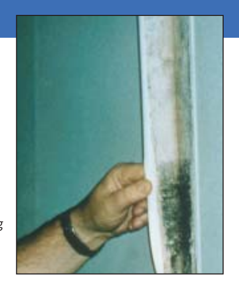
Mold growing on the back side of wallpaper.

Suspicion of hidden mold You may suspect hidden mold if a building smells moldy, but you cannot see the source, or if you know there has been water damage and residents are reporting health problems. Mold may be hidden in places such as the back side of dry wall, wallpaper, or paneling, the top side of ceiling tiles, the underside of carpets and pads, etc. Other possible locations of hidden mold include areas inside walls around pipes (with leaking or condensing pipes), the surface of walls behind furniture (where condensation forms), inside ductwork, and in roof materials above ceiling tiles (due to roof leaks or insufficient insulation).