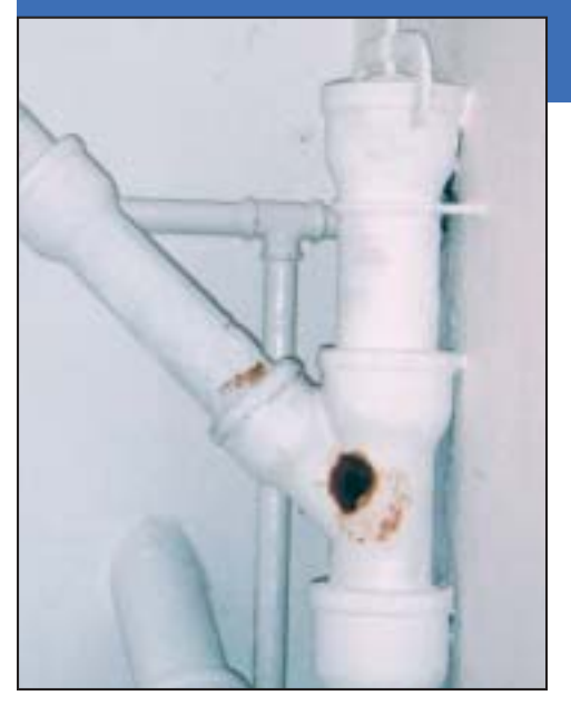
Rust is an indicator that condensation occurs on this drainpipe. The pipe should be insulated to prevent condensation.

local, state, or federal health or housing authorities.