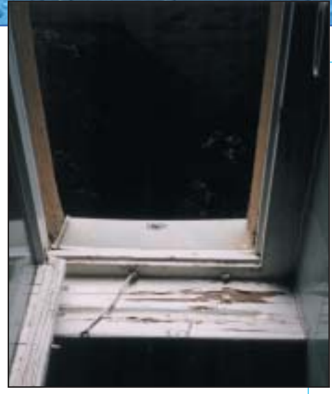
Leaky window – mold is beginning to rot the wooden frame and windowsill.

If you already have a mold problem – ACT QUICKLY.