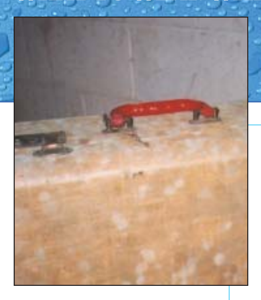
Mold growing on a suitcase stored in a humid basement.