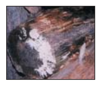
Mold growing outdoors on firewood. Molds come in many colors; both white and black molds are shown here.

hy is mold growing in my home? Molds are part of the