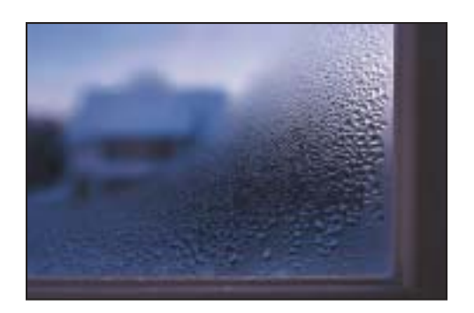
Condensation on the inside of a windowpane.